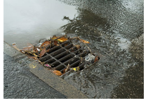
Catch basins carry stormwater directly to nearby waterbodies.

The City prohibits illicit discharges through its Storm Water Ordinance and may charge a fine to those who illegally discharge to the storm drain system. While the City is responsible for maintaining the storm drain system, it is everyone's responsibility to prevent illicit discharges and to notify the City if you see something that should not be there.